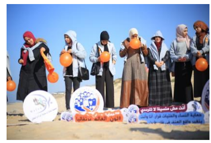
December 2022 at an event during the 16 Days of Activism Campaign against GBV