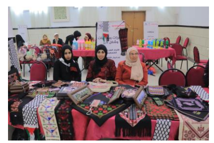
Young women entrepreneurs present their producs at an event "Ambitions for Change" organised by the youth- and women-led groups.

at an event during the 16 Days of Activism Campaign against GBV